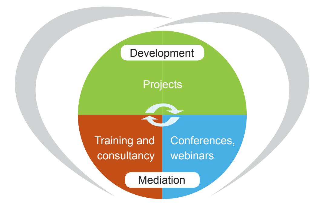
Figure 3: ECML programme of activities

ECML activities can broadly be grouped into two categories: development and mediation. As the name suggests, the development strand, usually in the form of projects, focuses on innovation, on the creation of new resources in response to current challenges; the mediation strand, usually in the form of ECML training and consultancy , focuses more on the implementation and adaptation of existing ECML resources to different national contexts and on the promotion and dissemination of these resources through conferences, colloquia or webinars. Although this Call refers specifically to the development strand, applicants need to understand how the two strands complement each other.