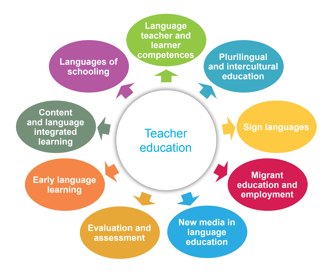
Figure 1: ECML resources are organised under these thematic areas

together up to 100 stakeholders, is in a unique position to address these challenges and influence reform processes.